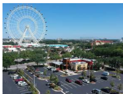
Brick House Tavern Orlando