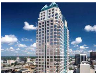
SunTrust Bank Downtown Orlando