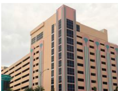
Mango's Tropical Cafe Orlando